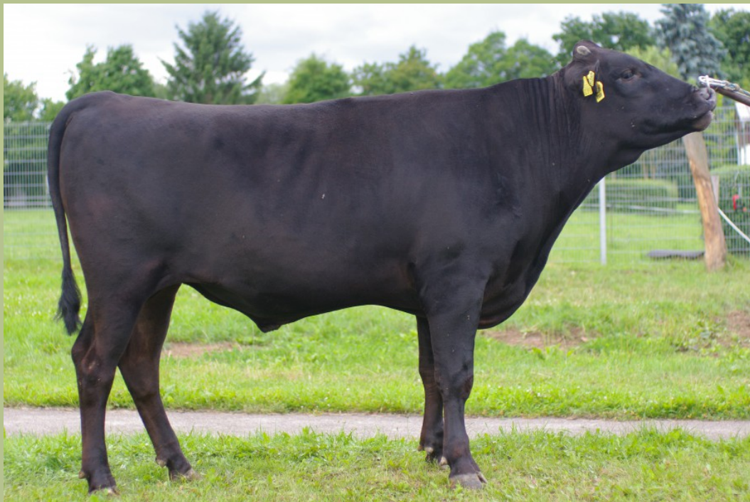
(Deutsch) GWG1614z Ms Itoshigenami x GWG1028 Kikutsurudoï

Sorry, this entry is only available in Deutsch.