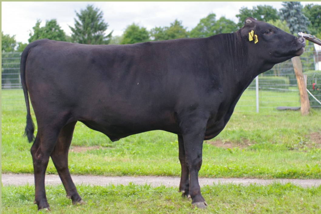
(Deutsch) GWG1614z Ms Itoshigenami x GWG1028 Kikutsurudoï

Sorry, this entry is only available in Deutsch .